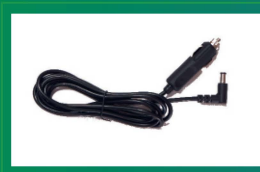
DC Power Cord