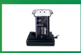
iGo2 Charging Station (Battery not included)