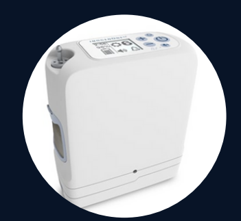
Portable Oxygen Concentrators