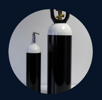
Oxygen Cylinders and Cylinder Refills